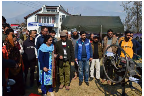
Distribution of Chaff-cutters under National Livestock Mission (CSS)