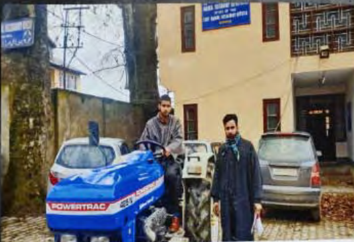
Distribution of Dairy Equipments under Dairy Development Scheme