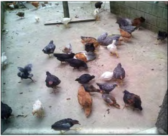
Backyard Poultry Development Programme