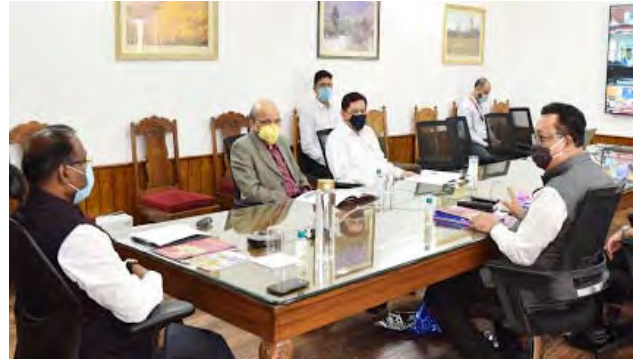
Hon'ble Lt. Governor Shri G. C. Murmu launching Kisan Pakhwada