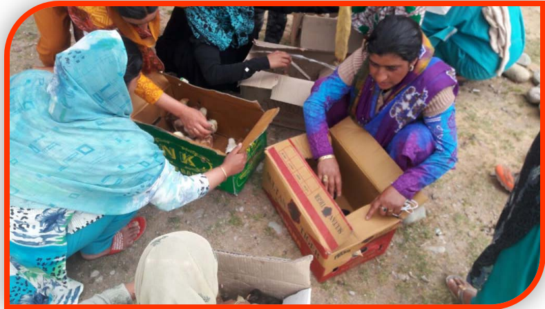
Low Input Tech birds being distributed