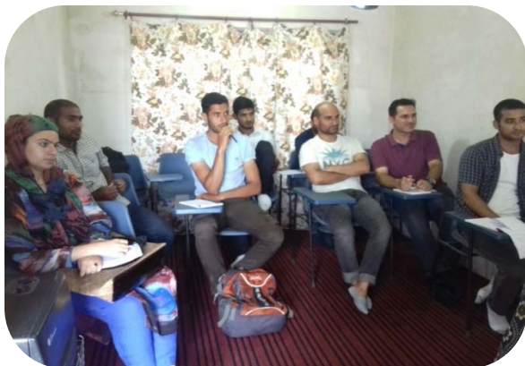
Under Skill Development Initiatives Capsule Training of unemployed educated youth at JDP Hariparabath