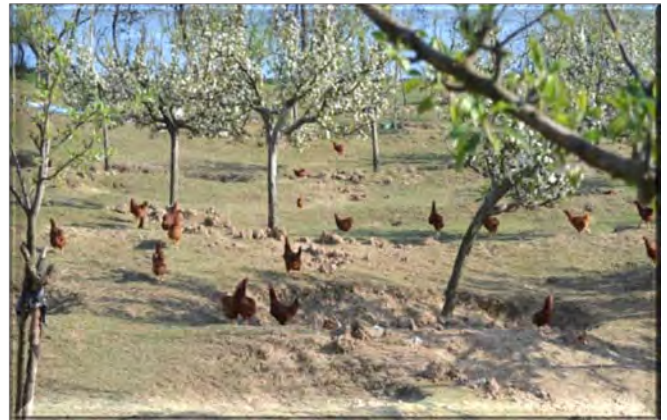
Semi-intensive Rearing of Low Input Tech Birds