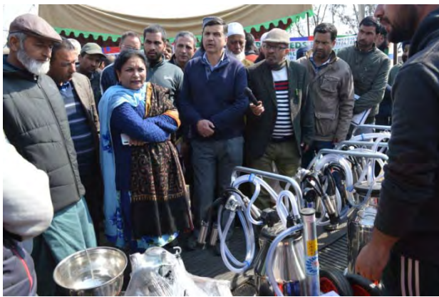
Kisan Mela at IAH&BP Zakura