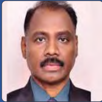
Shri Girish Chandra Murmu Hon'ble Lt. Governor Jammu & Kashmir

Vision | Initiatives | Achievements | Success Stories