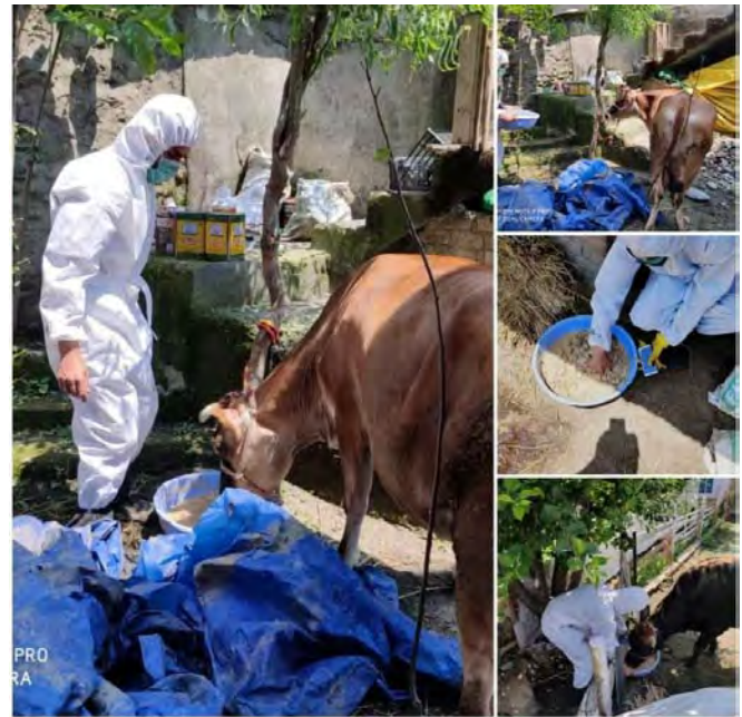
Animal Husbandry COVID-19 Warriors providing feed and necessary healthcare to livestock of people who were under Administrative Quarantine in district Bandipora