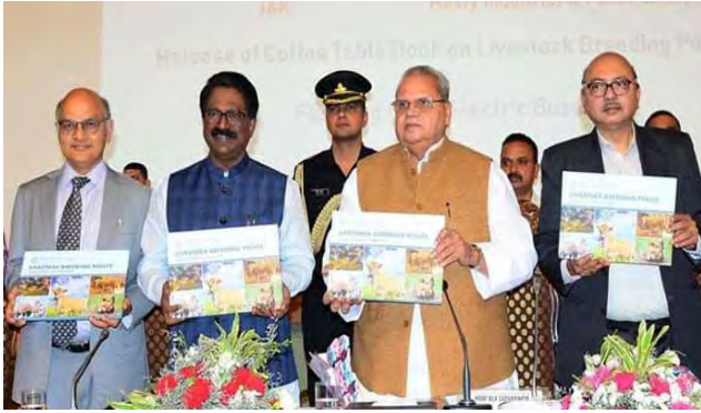
Hon'ble Governor Shri S. P. Malik released coffee table book on Livestock Breeding Policy Rules