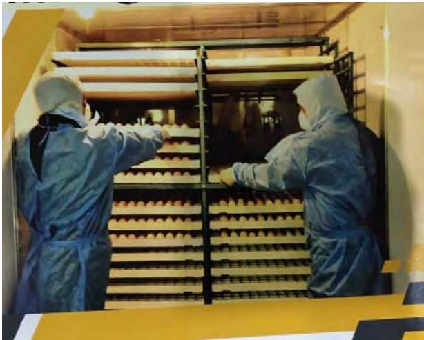
Activities under Poultry Development Programme