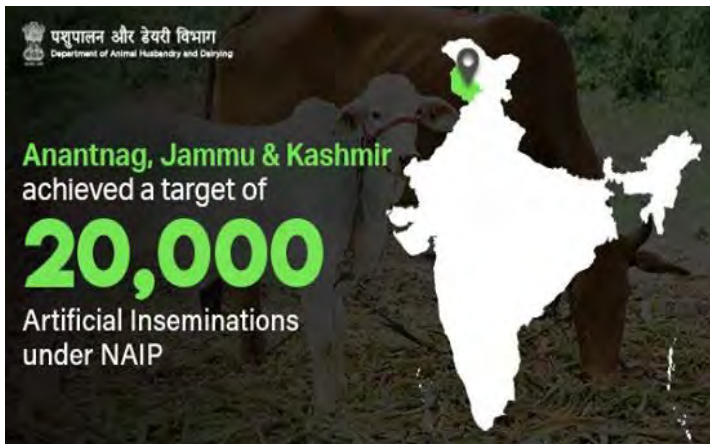
District Anantnag achieved the target of more than 20,000 AI's under NAIP