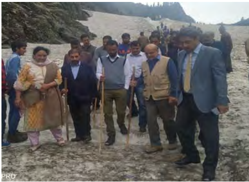
Worthy Chief Secretary during SANJY-2019